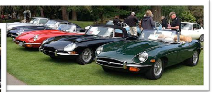
From C.O.N.T.R.O.L. to MI6 . . . Maxwell Smart to James Bond . . . all major agencies were represented.